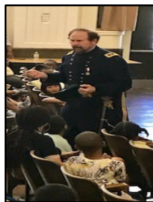
The General visits his school! (See Page 3)

To Contact the Meade Society: generalmeadesociety.org meade@generalmeadesociety.org