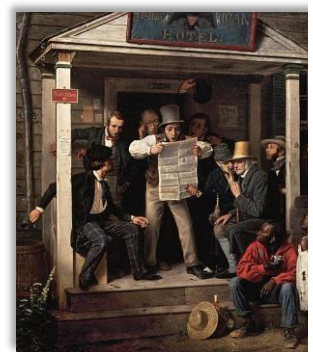
War News from Mexico, Richard Caton Woodville (1848)